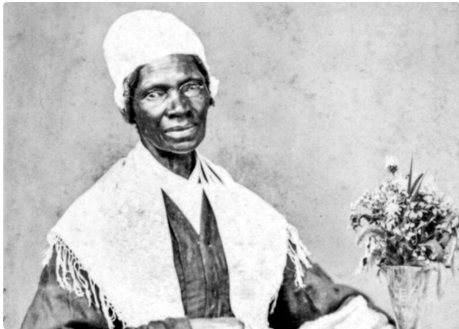
Sojourner Truth, "Ain't I a Woman?" 1851