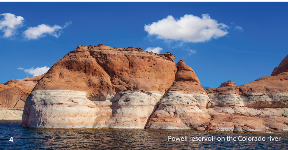
Powell reservoir on the Colorado river