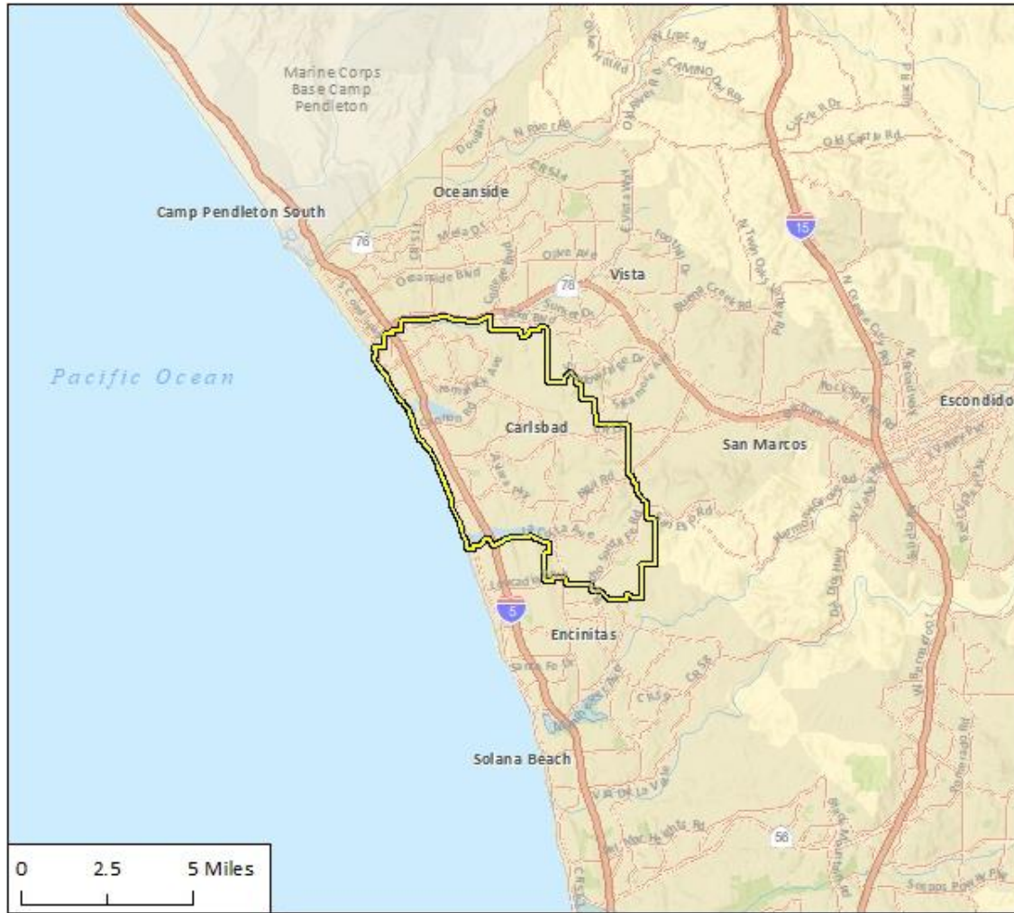
Figure 1 Regional Location

The regional setting is depicted in Figure 1. The Planning Area consists of the existing city limits and is depicted in Figure 2.