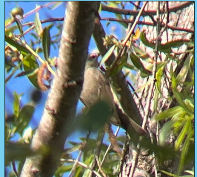
LBVI foraging at Quarry Creek.