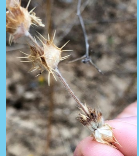
San Diego thornmint ( Acanthomentha ilicifolia )