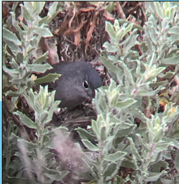
Female CAGN on nest at Carlsbad Raceway.

SDHC also surveyed for the federally endangered least Bell's vireo ( Vireo bellii pusillus ; LBVI) at Quarry Creek.