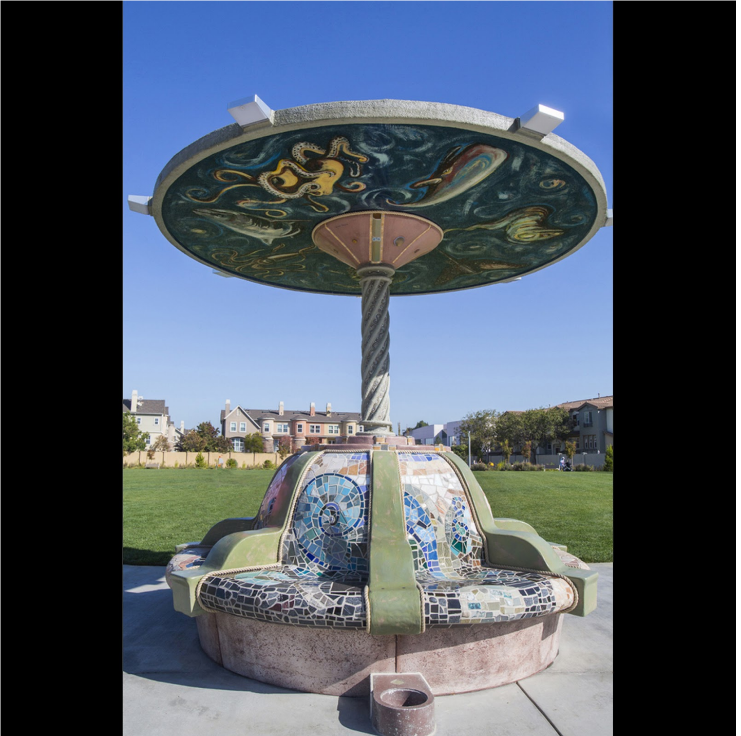
6) " Under the Seven Seas ", Mixed media, Solar lit, Sculptural Bench (10'x10'x10'), for the Seven Seas Neighborhood Park, Sunnyvale, CA . Commissioned by the City of Sunnyvale. 2014.