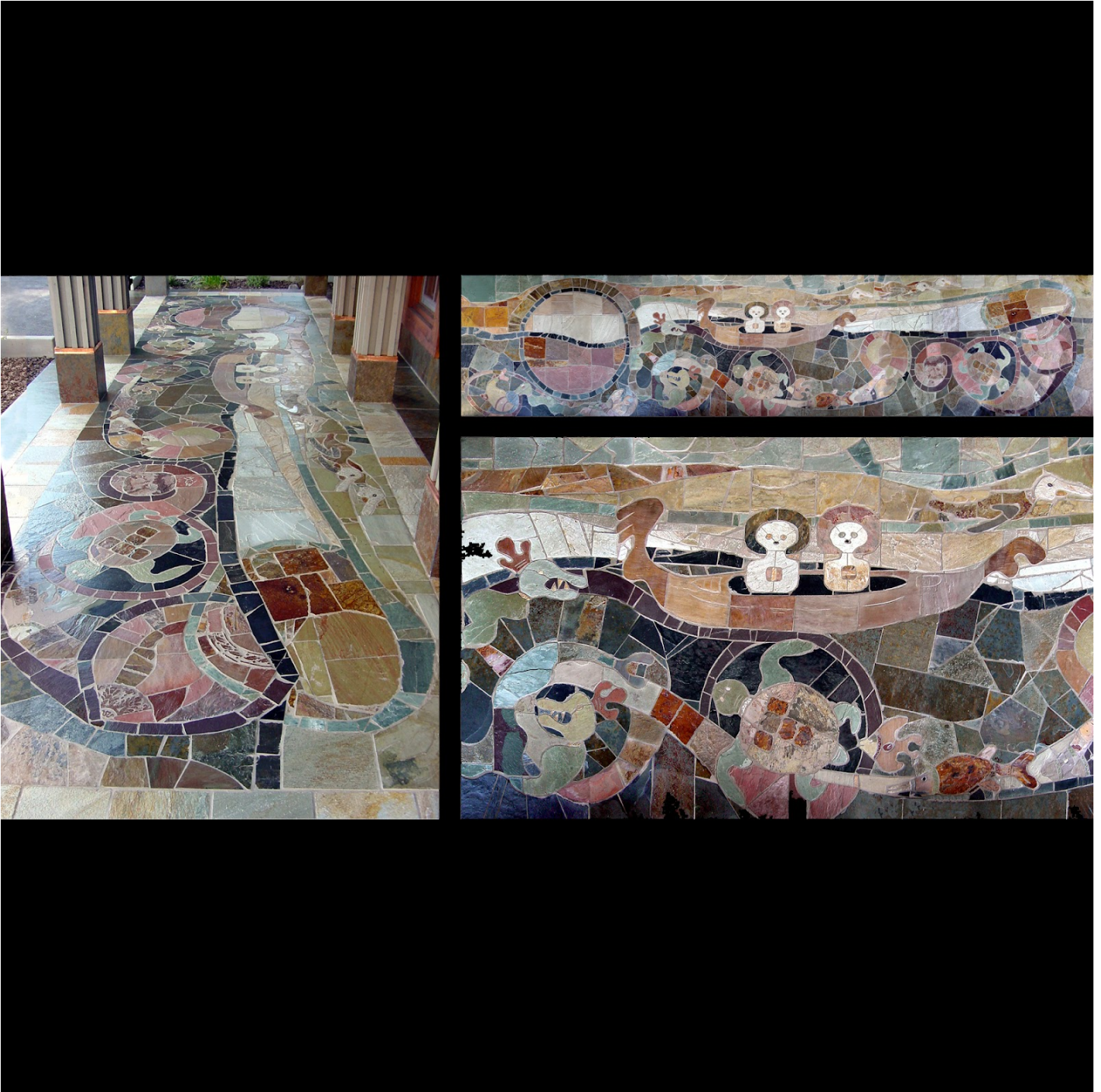
9) “ Flowing ”, mosaic porch/walkway (9.5’x31’), for the Home Concepts Interior Design Center, 10198 Church st., Truckee, CA. Design integrates the flow and movement of water with numerous interesting figures. 2001.