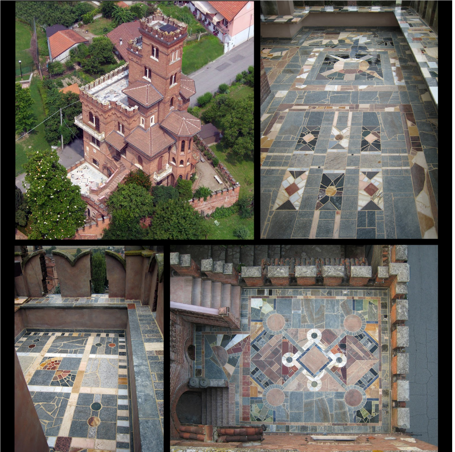
7) “ Sotto il Sole ”, mosaic patios and bench/walkways (granite, marble, 70% reclaimed) on the 2 nd , 5 th floors (1600 s.f.), Castello Balzola, Piemonte, Italy . 2010.