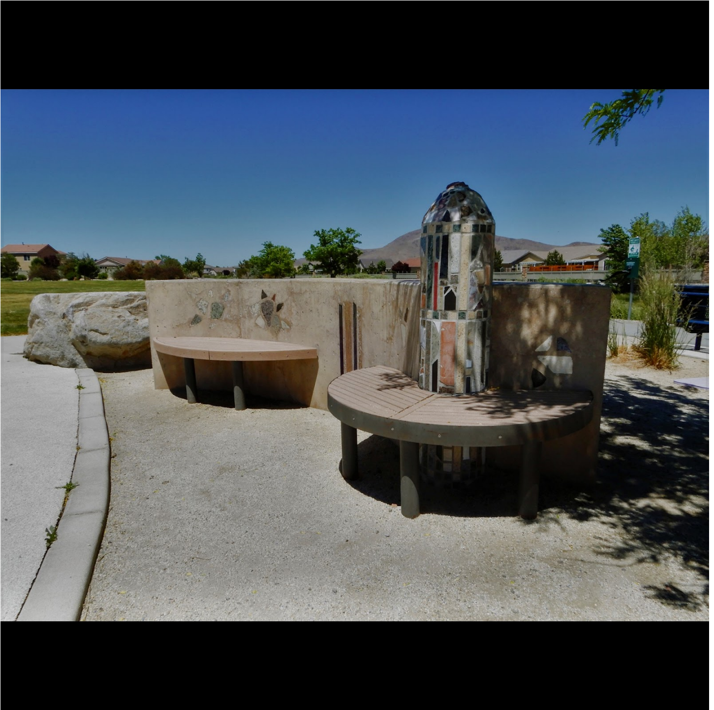
8) “ Svirgola ”, cast-in-place colored concrete sculptural bench (3’x15’x5’), in the Center Creek Park, Reno, NV . 2006. Commissioned by the City of Reno.