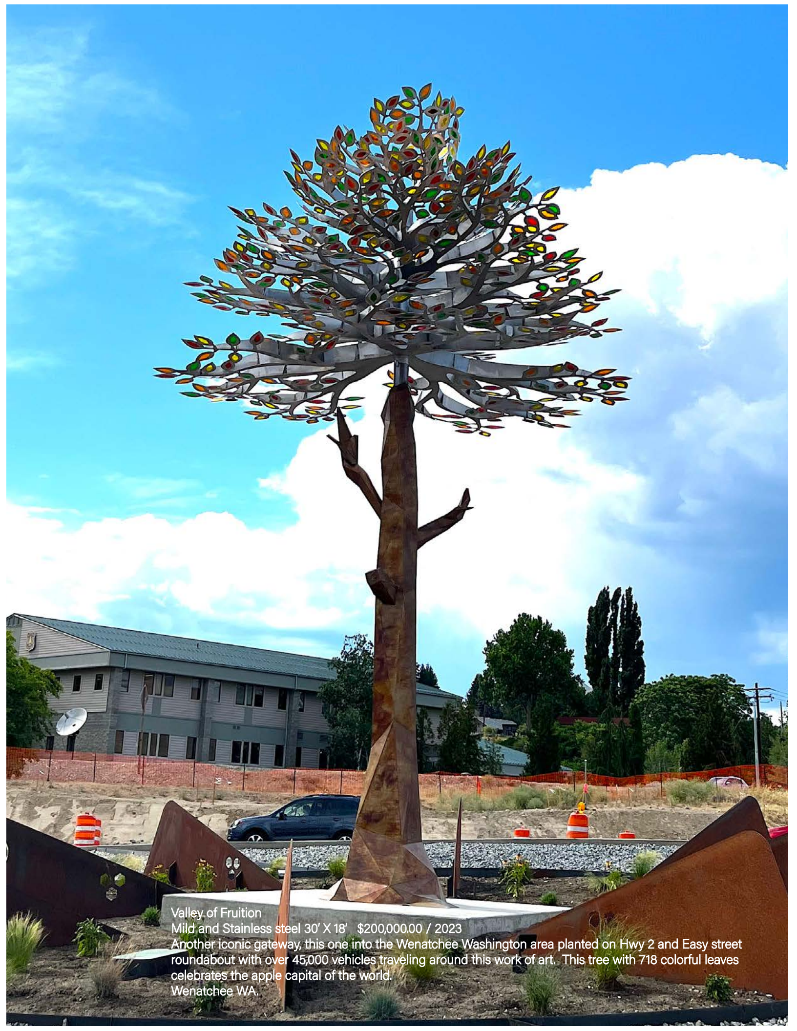
Valley of Fruition Mild and Stainless steel 30' X 18' $200,000.00 / 2023 Another iconic gateway, this one into the Wenatchee Washington area planted on Hwy 2 and Easy street roundabout with over 45,000 vehicles traveling around this work of art. This tree with 718 colorful leaves celebrates the apple capital of the world. Wenatchee WA.