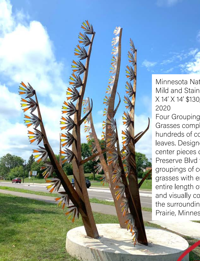
Minnesota Natives Mild and Stainless steel 25' X 14' X 14' $130,000.00 / 2020 Four Groupings of Native Grasses complete with hundreds of colorful acrylic leaves. Designed as the center pieces of the new Preserve Blvd these large groupings of colorful grasses with enhance the entire length of the Blvd and visually compliment the surrounding tress. Eden Prairie, Minnesota.