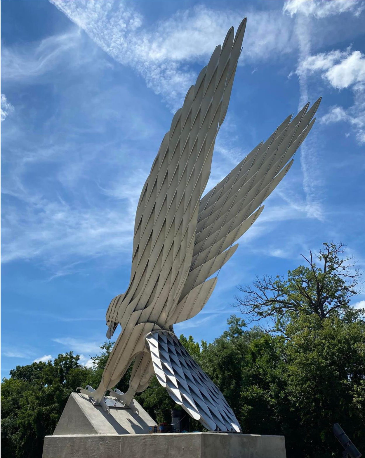
Tip of the Spear