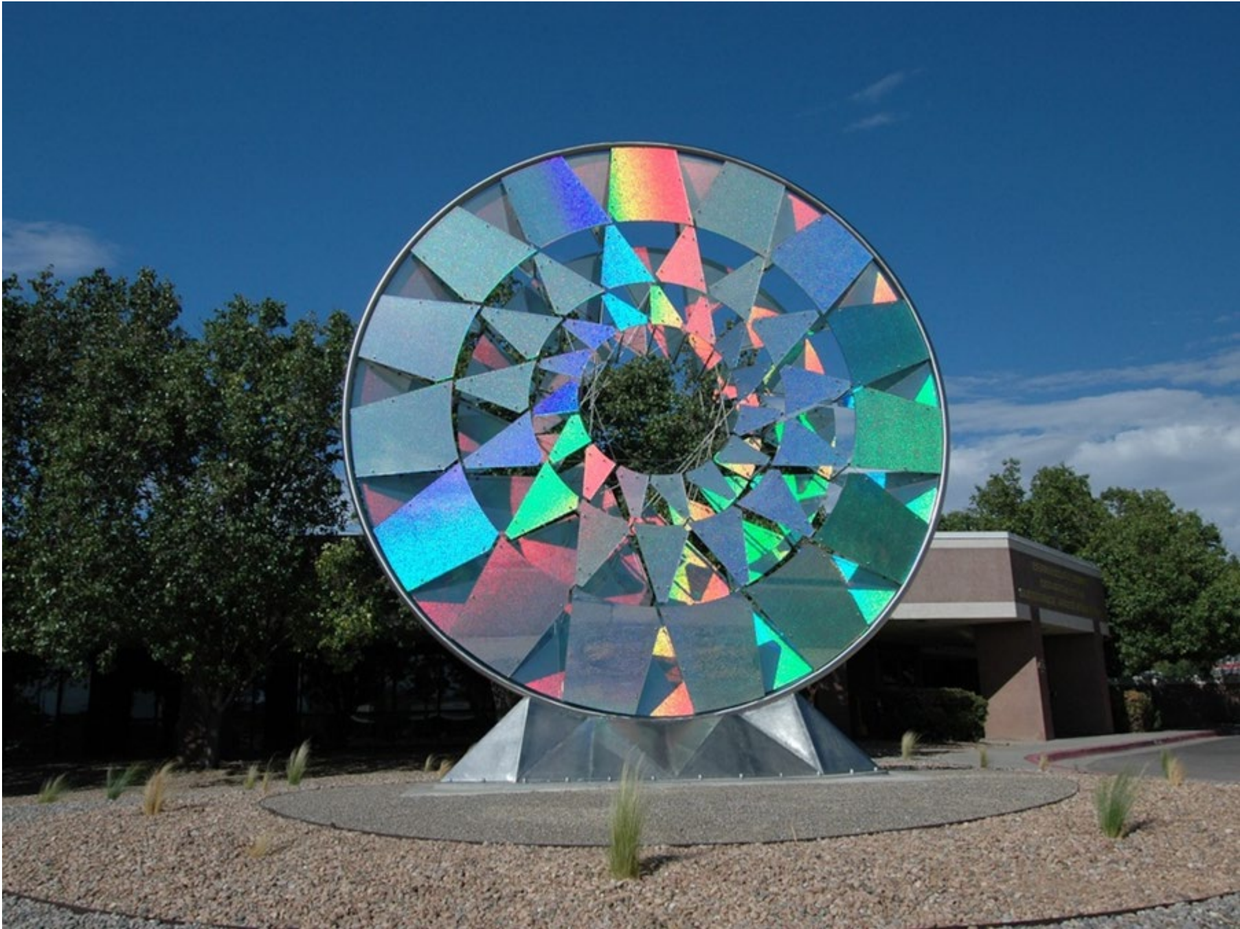
04. Solar Disc