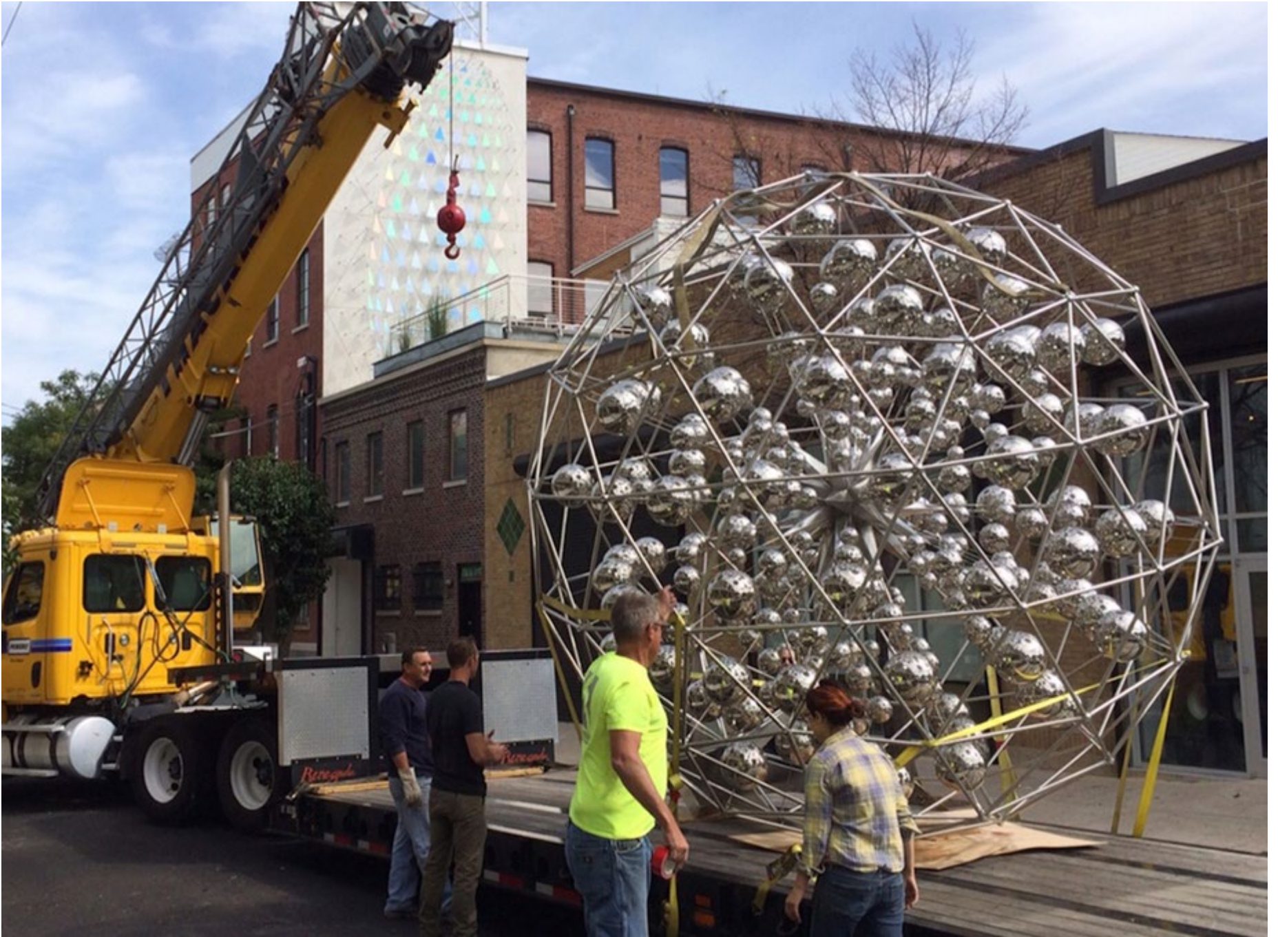
10. Schuylkill Beacon