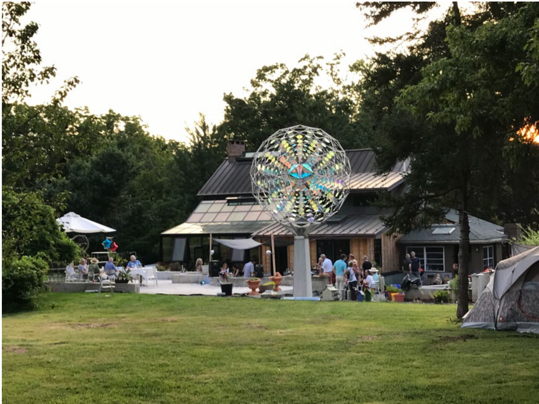
07. Stockton Star