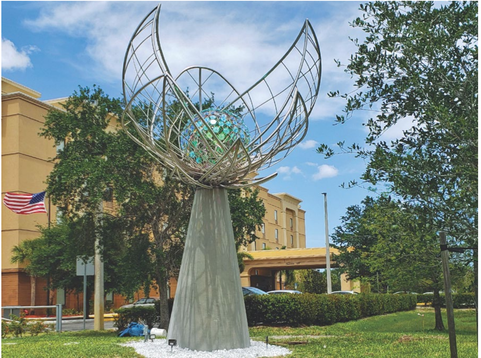
09. Tamarac Orchid