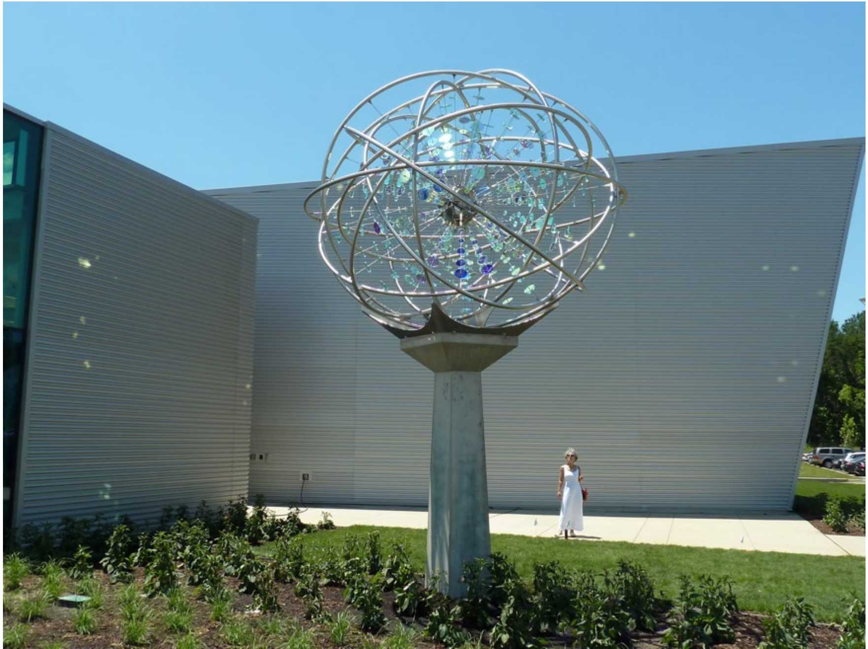
05. Tec/Rec Beacon