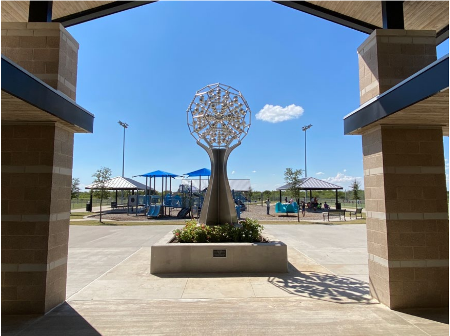
02. Vela's Trophy