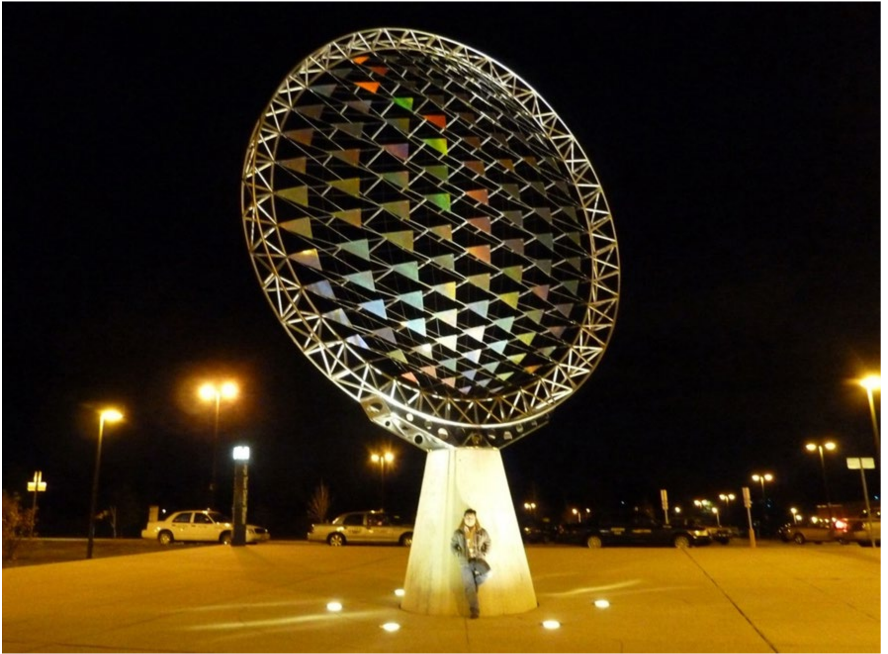
08. Largo Lens