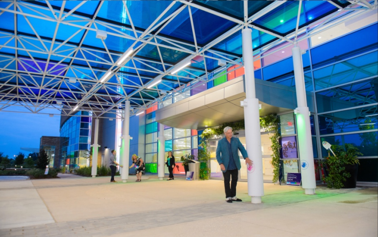
“Harmonic Grove,” 80’ W x 40’ D x 15’ T, Colored Glass, Steel, Light, Sound, Interactive