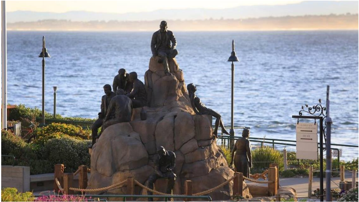
Work Sample #8