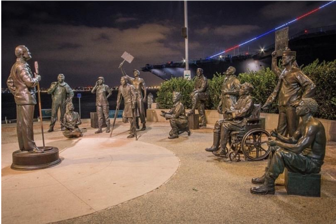
Work Sample #4