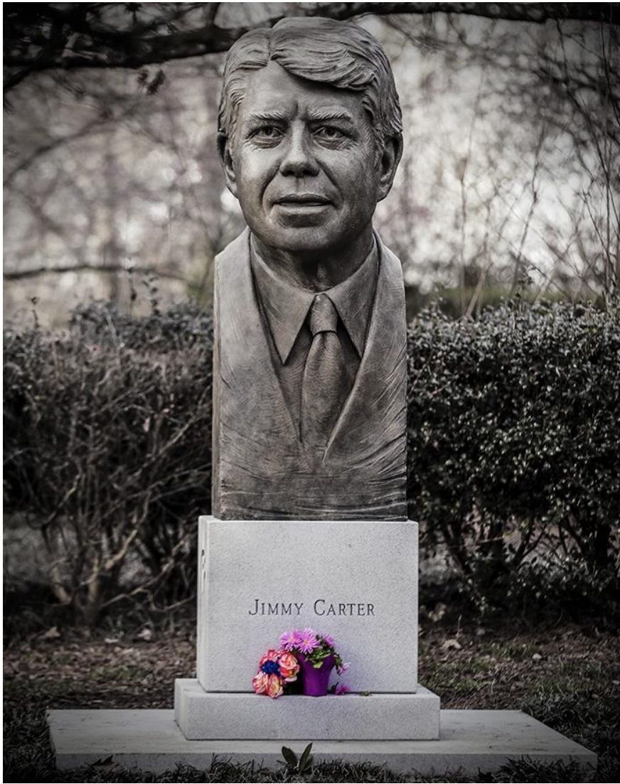
Work Sample #6