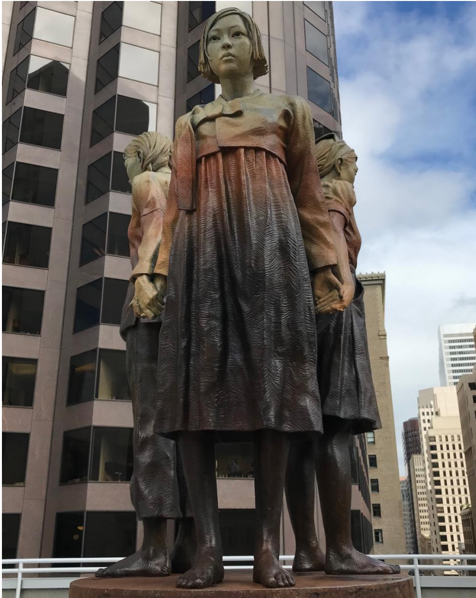
Work Sample #1