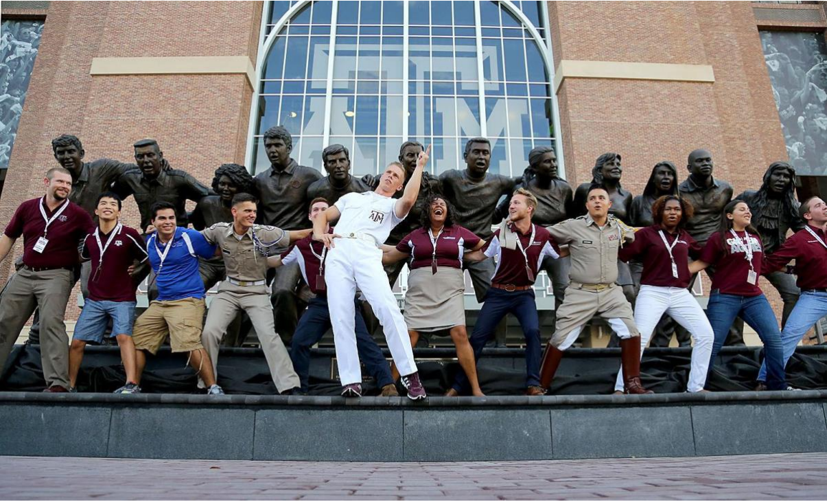
Work Sample #7