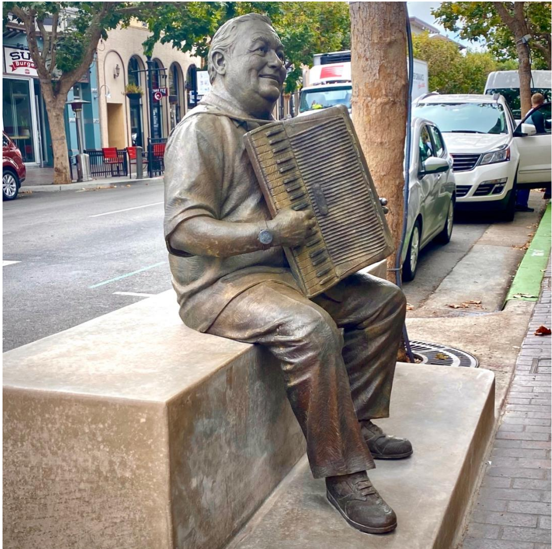
Work Sample #9