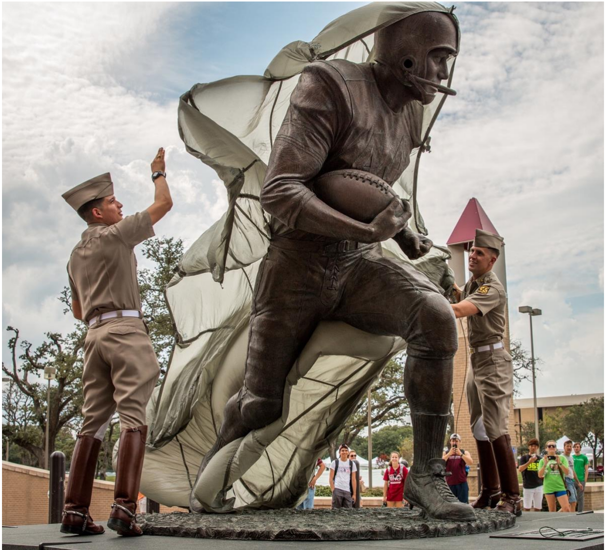
Work Sample #5