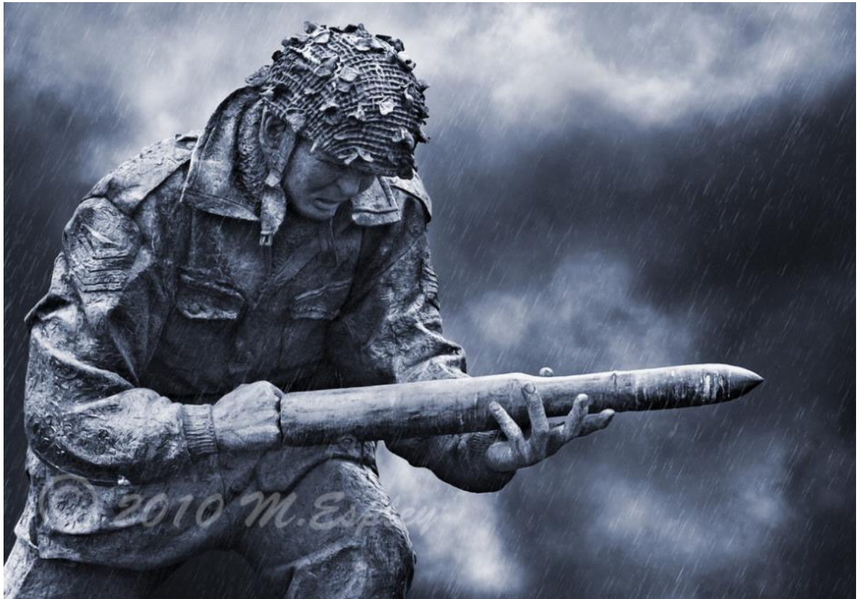
Work Sample #10