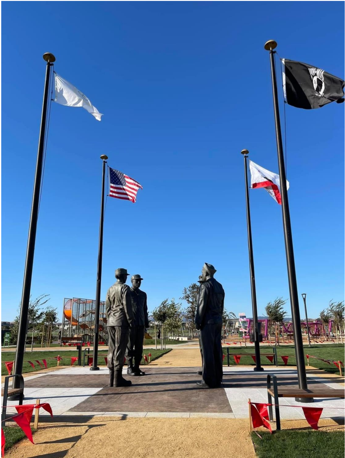
Work Sample #3