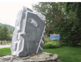
Last Love 1a.jpg

LAST LOVE 1 2006 Stone: Italian Blue Verona Marble 9' x 6' x 3' 6 tons. Commissioned by the Resort Municipality of Whistler, Whistler, British Columbia, Canada. The sculpture embodies the universal truth of love. It brings us a great joy and the depth of agonies and is something that we all desire.