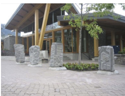
Last Love 2-5b.jpg