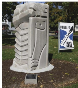
8. Last Love 6b.jpg

LAST LOVE 6 2010 Stone: Indiana Limestone 7' x 3' x 3.5' 5 tons. Commissioned by the City of Vandalia, Ohio, USA. Completed during 'Vandalia Chiseled' Stone Sculpture Symposium (Sept. 2010) First public sculpture in stone in USA.