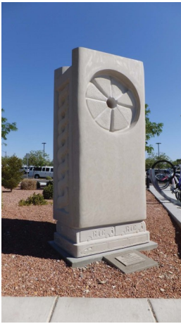
6. Motion 1a.jpg