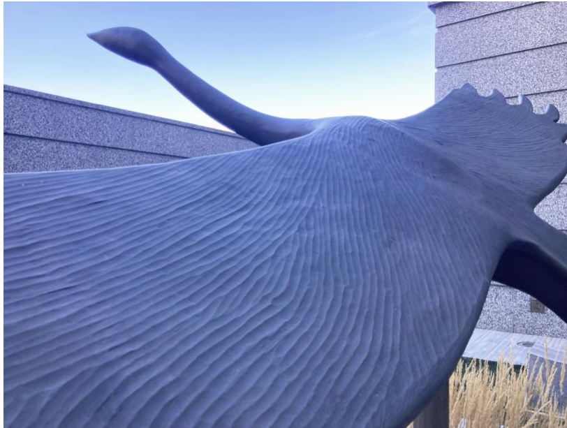
#4 and #5: TSURU