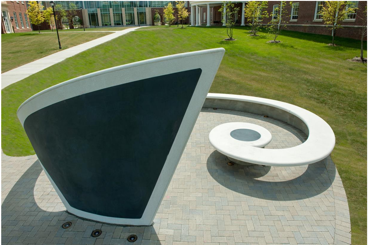
#1 and #2: GOLDEN SPIRAL