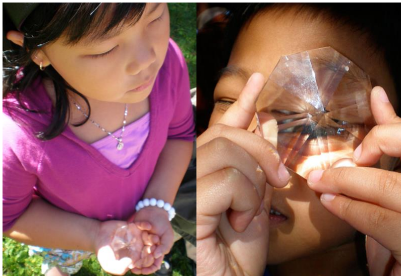
#8 and #9: WISHING WANDS