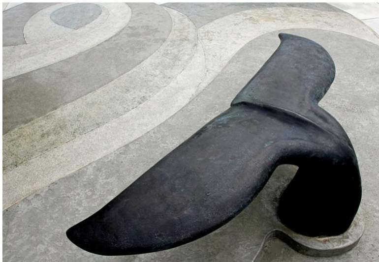
#6 and #7: FLUKE