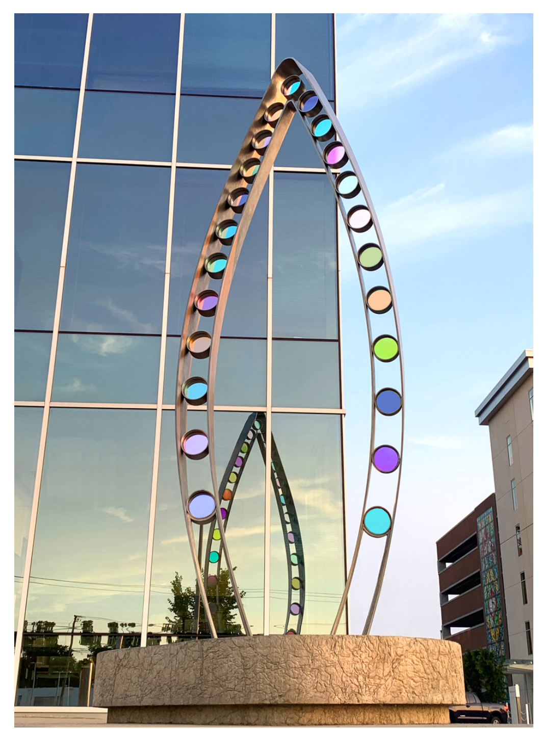
'Gratitude' 2023, 20'h x 12'w x 12'd Stainless steel, reinforced concrete, dichroic glass Sentara Cancer Center, Norfolk Public Art, Norfolk, VA Budget: $100k

The abstract and spiraling form changes from every point of view. With imagination, one can see hands coming together in prayer, a cancer ribbon, a leaf, an infinity symbol, a fish and more. The dichroic glass changes color as visitors walk by. Sitting under the sculpture is a place to find meaning in the layered symbolism, along with joy and serenity.