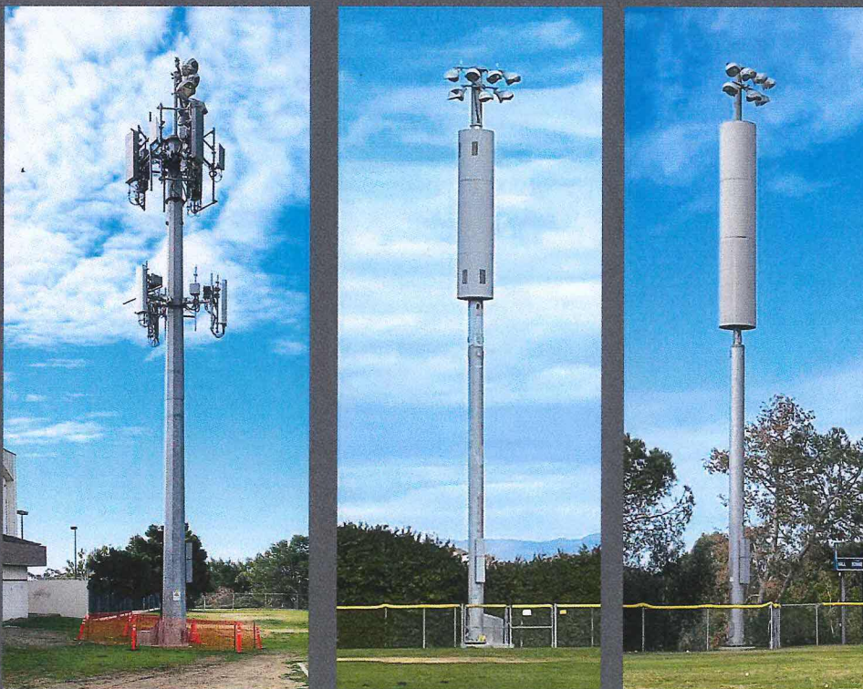
Existing Cell Towers at Calavera Hills Park

This is what we are trying to prevent from being installed next door at Poinsettia Park.