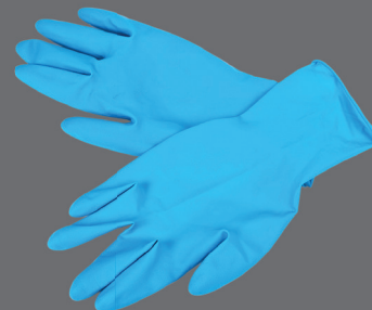
All other material