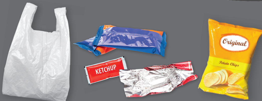
Plastic bags & wrappers