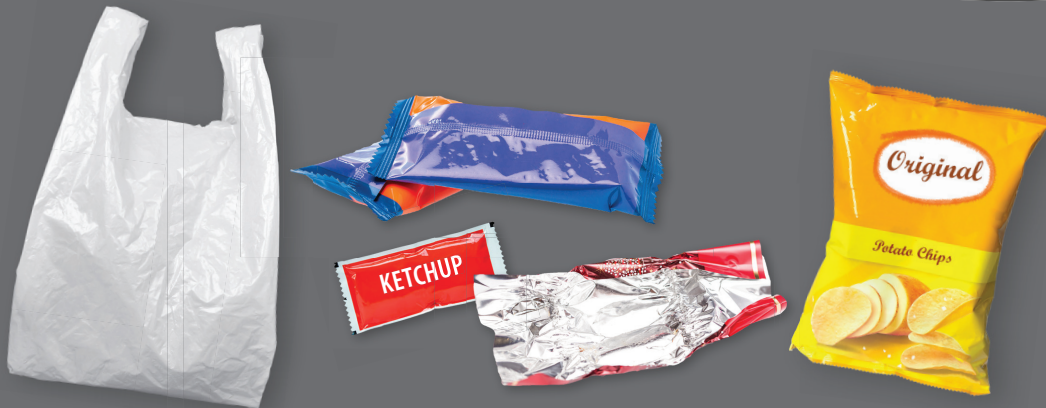
Plastic bags & wrappers