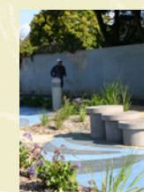
Coastal Rail Trail