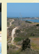
Golf Course & Veterans Park