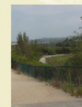
La Costa Valley Trail