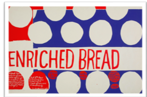
In that they may have life , 1964 Serigraph