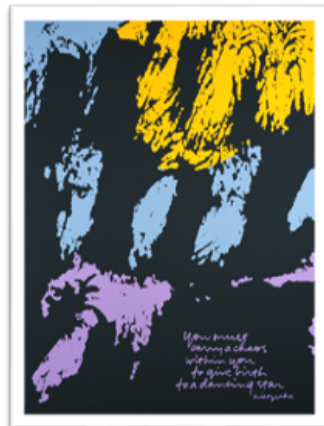
Dancing Star '82 , 1982 Serigraph Text: You must carry a chaos within you, to give birth to a dancing star, Nietzsche