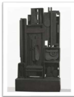
Lunar Landscape, 1959-60 Painted Wood