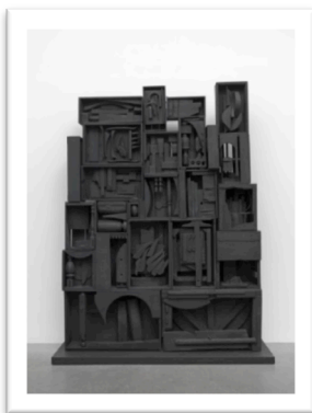
Black Wall, 1959 Painted wood