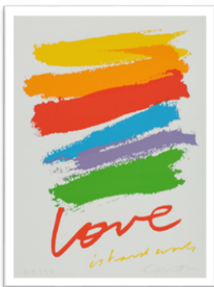
Love is hard work , 1985 Serigraph Text: Love is hard work