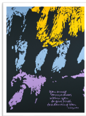
Dancing Star '82 . 1982 Serigraph Text: You must carry a chaos within You to give birth to a dancing star. - Nietzsche