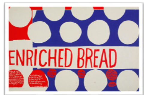
In that they may have life , 1964 Serigraph