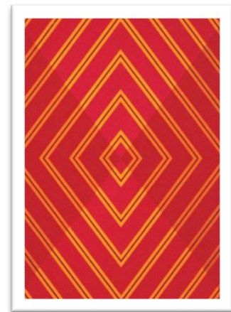
Margarita Azurdia, Untitled works from the series "Geometric Abstractions" , ca. 1968 and 1967, acrylic on canvas