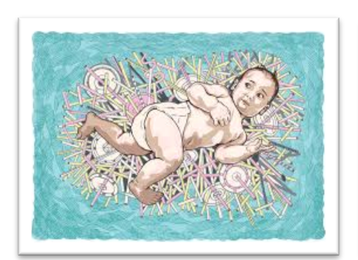
Year of the Straw, 2019, Serigraph

"Year of the Straw" asks viewers to consider the expanding consequences of human pollution on our environment and on future generations.