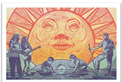
Tierra Del Sol Community Center