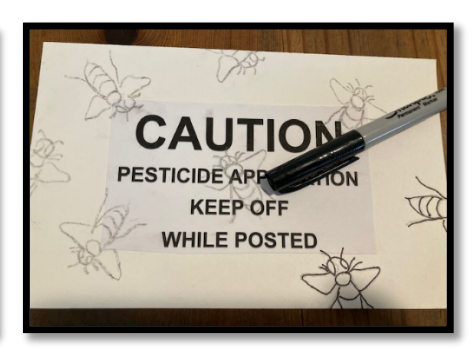
FIG. 4 FIG. 5 FIG. 6