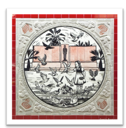
MacArthur Park Westlake Metro Station