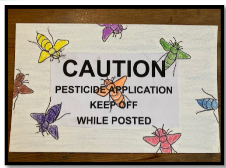
FIG. 7 FIG. 8