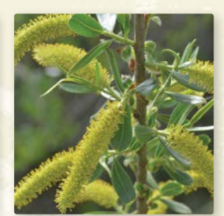
Arroyo willow Habitat: riparian