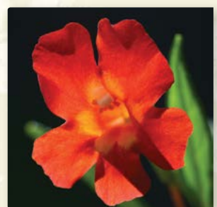
Monkey flower Habitat: coastal sage scrub