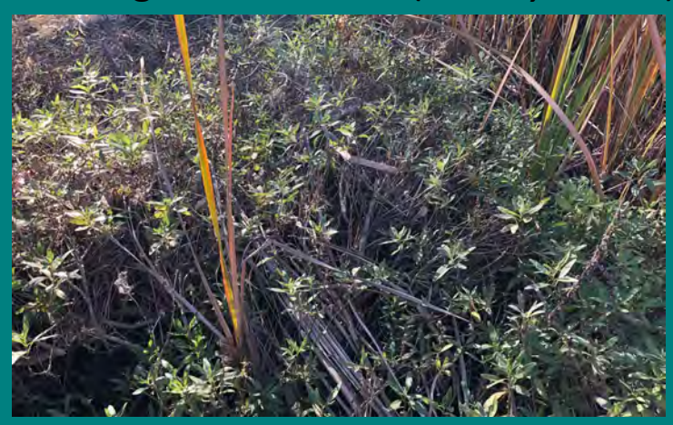
Southwestern Spiny Rush ( Juncus acutus ssp. leopoldii )