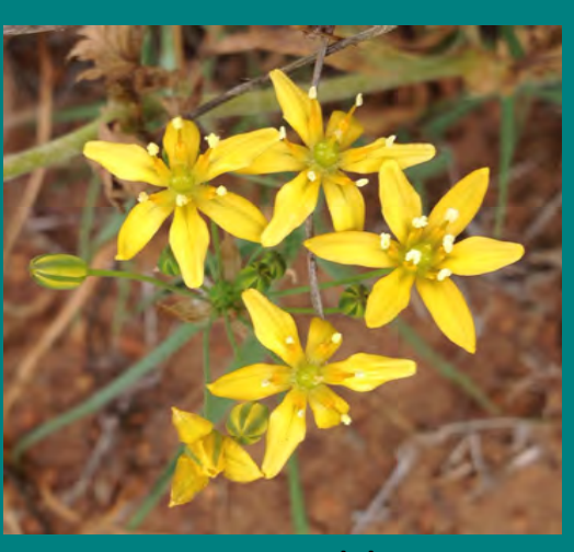
San Diego Goldenstar