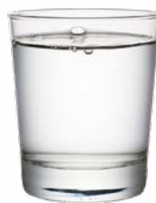
1 gallon of Carlsbad's tap water costs about a penny