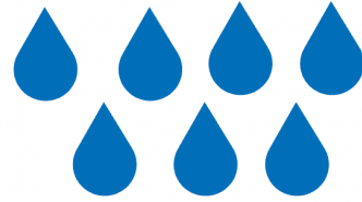
Rate based on amount of water used