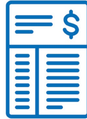
Water portion of monthly bill

Residential and commercial water rates are made up of two parts: