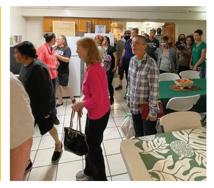
Received grant funding from three large private entities to expand the work of the RTFH beyond federal and state grants.

Continued to work with the Impact Center to strengthen organizational leadership and create strong culture of communication and planning.