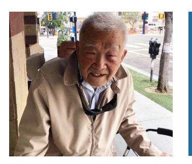
Created new leadership position to engage with local government partners.

Seated an influential and diverse Board of Directors and created several board committees focused on finances, governance, and external relations.