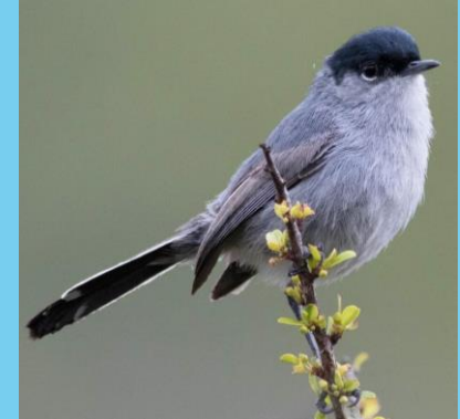
Coastal California Gnatcatcher ( Polioptila californica californica)

Surveys for least Bell's vireo will be performed this year at the Quarry Creek Preserve.